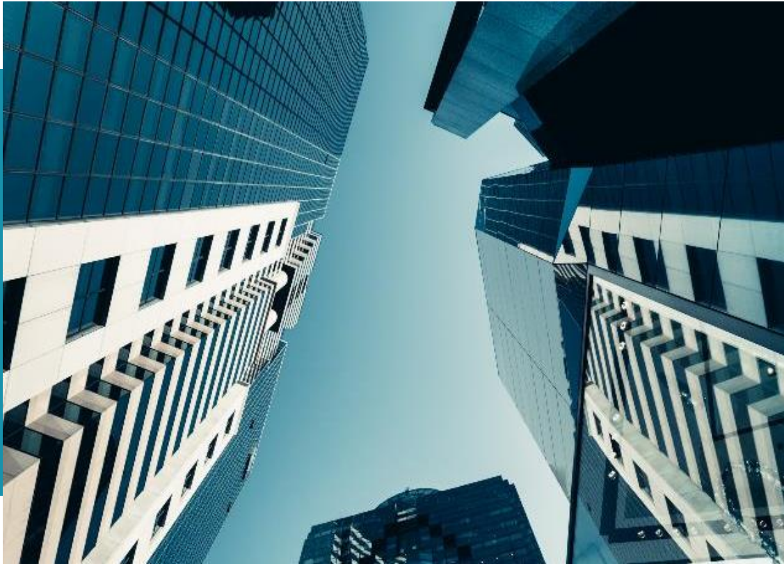
Colorado Field Office